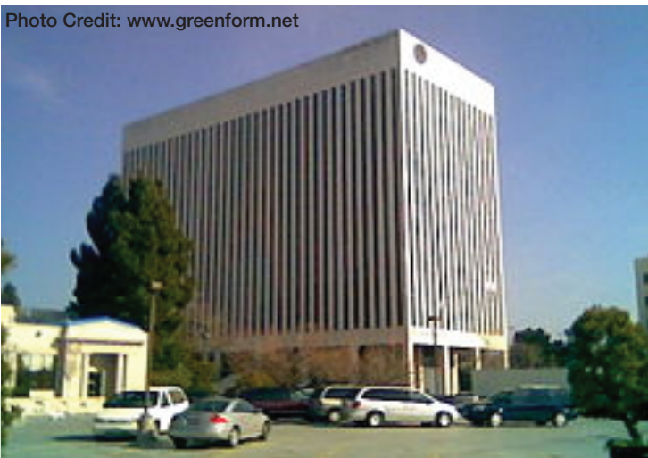
The Hayward City Center (shown here) is a mixed-use remodel project that has received LEED CS pre-certification at the Gold Level.